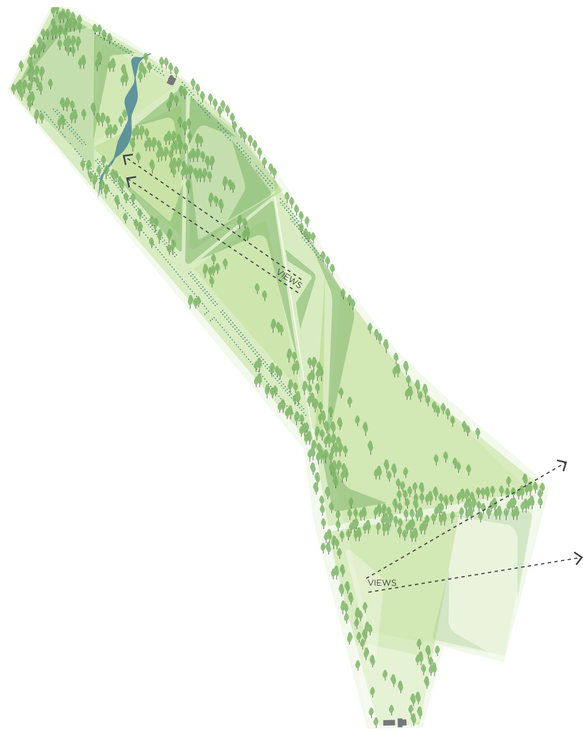
SCENIC LANDSCAPE SETTING