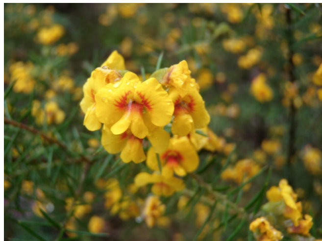
Important vegetation is found in the Park

Cumberland Plain Woodland is also listed under the Commonwealth Environmental Protection and Biodiversity Conservation Act 1999 (EPBC Act). National Parks and Wildlife Service (NPWS) mapping of vegetation on the Cumberland Plain in 2002 identified a number of vegetation communities as occurring within the Park, including alluvial