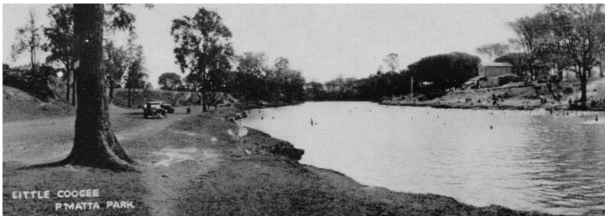
Little Coogee along the Parramatta River

Creeks and ponds in the Western and Eastern Domain areas have been subject to high levels of siltation and weed invasion. The ponds were designed in the 19th Century as ornamental lakelets and water bodies for stock. All of these water forms have changed configuration and are now part of the urban catchment of Parramatta and Toongabbie and Darling Mills Creek.