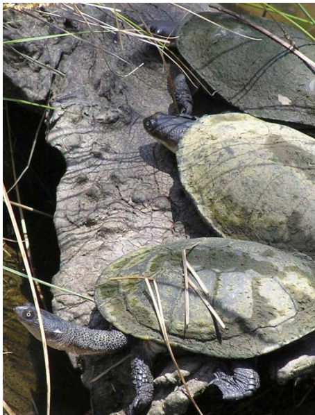
Eastern Long-necked Turtle

At least 40 bird species are regulars to the Park. They include a variety of waterbirds and woodland species such as Dusky Moorhen, Red-rumped Parrots and Azure Kingfisher. The White Ibis and Noisy Miner are over abundant and problematic; the Trust monitors Ibis numbers and implements an annual Ibis control program of nest disturbance.