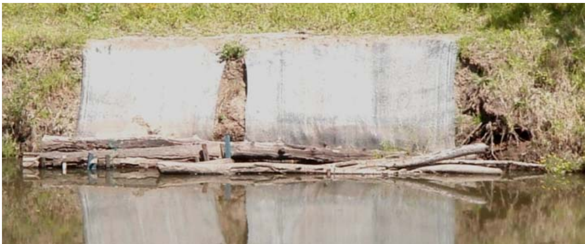
Erosion control and stream bank revegetation in the Park