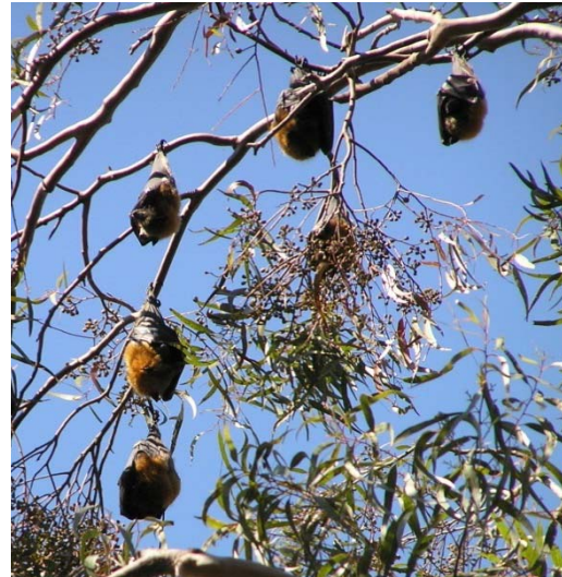
Grey-headed Flying Fox

Reptiles, typical of suburban waterways, are often sighted in the quieter habitats in the Park. Eastern Long-necked Turtles, Red-bellied Black Snakes, Blue-tongue Lizards and, particularly, Eastern Water Dragons have been seen.