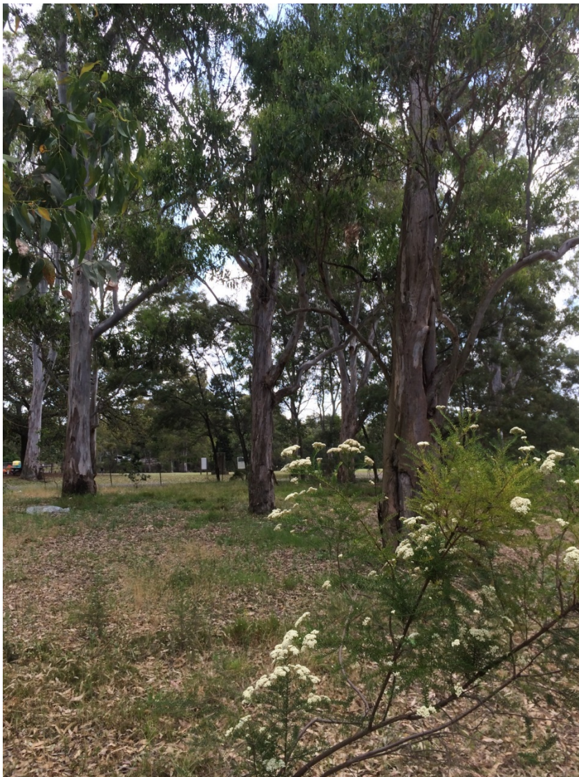
Park vegetation at The Crescent ridgeline

The major tree species is Forest Red Gum which dominates the slopes and ridges with the occasional Broad-leaved Ironbark and Grey Box. Rough-barked Apple, Broad-leaved Apple and River Oak dominate the riparian zone interspersed with Narrow-leaved Paperbark on swampy ground, and White Feather Honey myrtle and Prickly-leaved Paperbark in groups on the slightly better drained terrain adjacent to the creek lines. Pines, English Oaks, rainforest trees and Jacarandas provide a contrast to the native and indigenous trees and provide a reference to both the Vice Regal Domain period and the 19th Century Park period. A mixture of various introduced grass species is also evident throughout the Park.