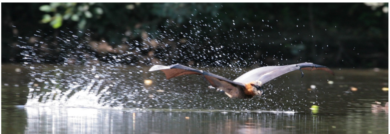
Flying Fox colony in the Park

The Trust acknowledges the Barramattagul of the Darug people, the traditional custodians of the land on which the Park is situated. The Trust will work in a respectful manner with the Darug people in Caring for Country and treat the Darug people, their cultural heritage, customs and beliefs with respect.